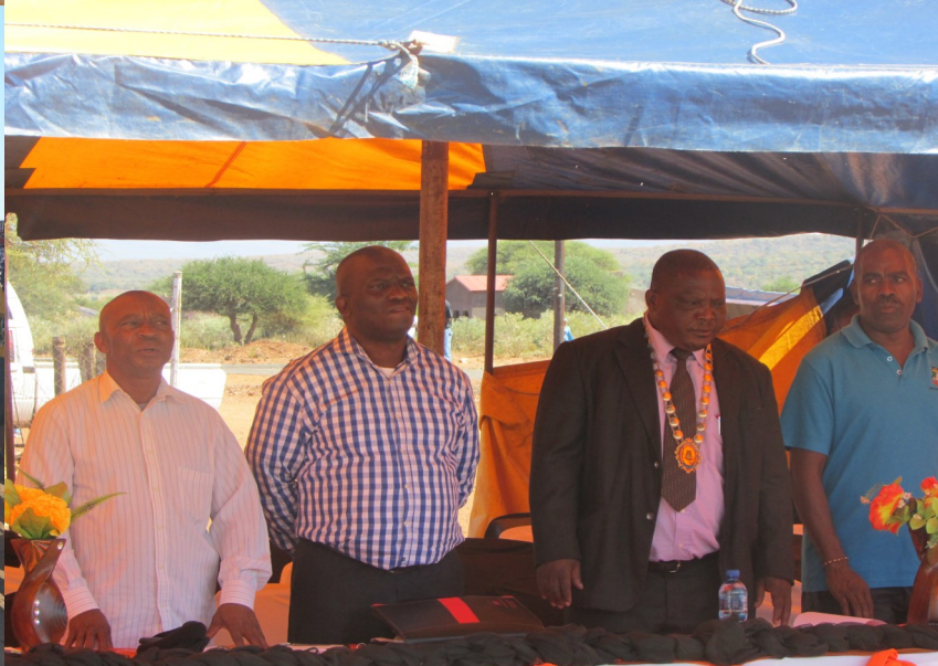
Pictures highlighting the events that took place during the last quarter