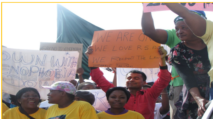
Ramotshere Moiloa residents during the "fight against xenophobia" march along the church street in Zeerust

The two hour march started at the local municipality parking lot, and continued to the main street, Church. The traffic and police officers led the convoy and also assisted in controlling traffic, pedestrians as well as by-standers along the pavements who had honoured the civil and meaningful march. Cont...next page