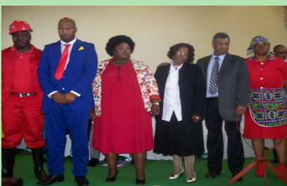
Executive committee of Ramotshere Moiloa Local Municipality