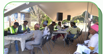
Officials assisting the residents during the campaign.

pay their accounts were given the opportunity to register as indigents. In order for them to qualify it may only require 2 state pensioners under SASSA (South African Social Security Agency) or with monthly salary that calculates under the sum up of R2800.