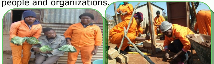
Some of the beneficiaries receiving help from CWP participants in form of vegetables from the gardens that they manage and participants are seen constructing a house

The useful work is planned in partnership with ward councillors and traditional and institutions identified through the support of Implementing Agents. Since its inception the programme has already bear fruits and the municipality can safely report that through the training that was offered, homes for elderly people, and a toilet were built in Lekgophu and Nyetse Home Based Care respectively. Vegetable gardens have been developed and the products thereof were donated to various people and organizations.